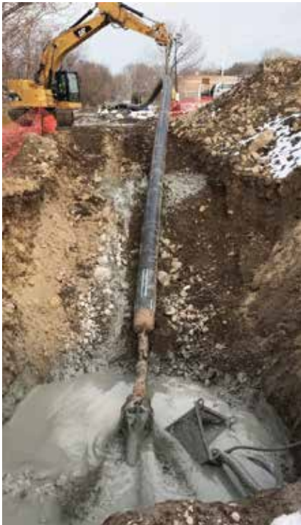
Figure 13: View of the east side work area at the beginning of pipe pullback

pile supported buildings. As required by regulatory agencies, the specifications also required the contractor to submit a detailed inadvertent return contingency plan delineating the steps that would be implemented in case of inadvertent returns.