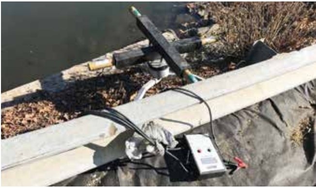
Figure 9: The Magnetic Beacon system