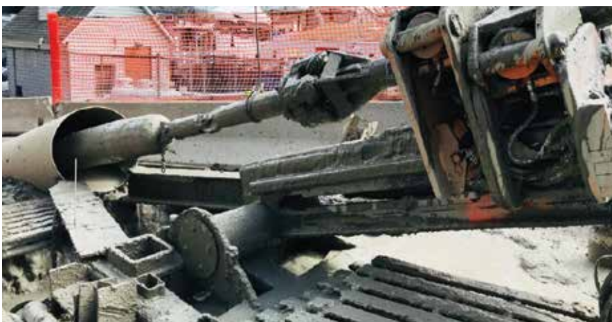
Figure 14: Product pipe pullback complete

In view of logistical and technical constraints, Carson Corporation chose