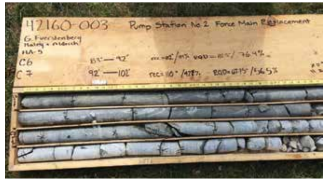
Figure 6: Sample rock core showing Precambrian Gneissic bedrock

challenges. In that regard, the project location posed a few logistical challenges.