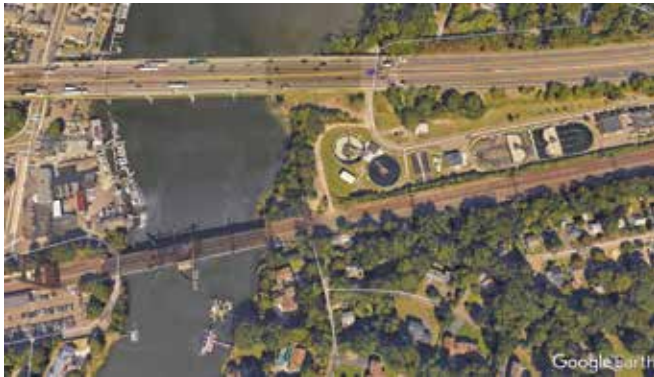
Figure 1: Project Location in Westport, CT