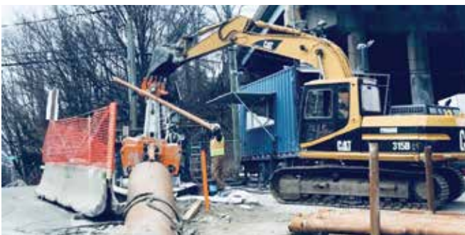
Figure 3: View of the HDD rig, overhead lines, I-95 bridge, site access and the conductor sleeve

As is the case for most trenchless projects in busy areas, it is critical to address the stakeholder challenges and logistics before tackling the technical