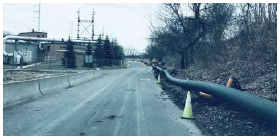
Figure 12: HDPE product pipe fused laid for pullback along Elaine road. WWPCF and I-95 are to the left and right side of the photograph respectively