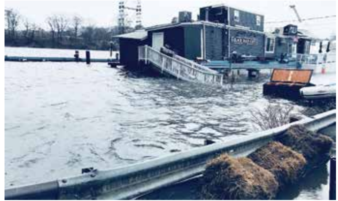
Figure 16: Flooding during one of the nor'easters

to drill from west to east so that drilling and pullback could be performed from the same side. Carson used an American Auger D210 with a smaller footprint to fit in the available work area.