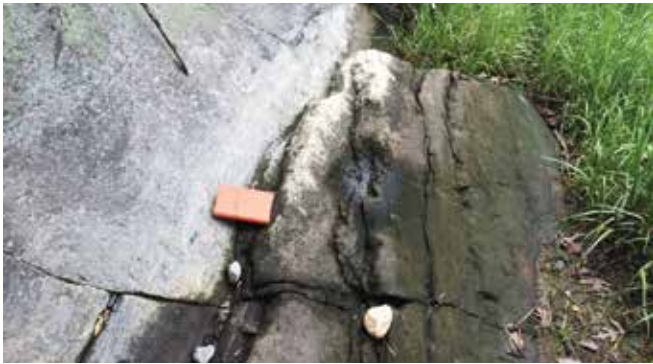
Figure 5: Marsh grass along with bedrock outcrops indicating steep joint sets west of Saugatuck River, Westport CT