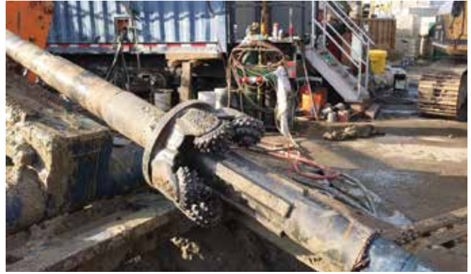
Figure 10: 22-inch diameter reamer on the HDD rig before starting the ream

the subsurface exploration program for the HDD alignment.