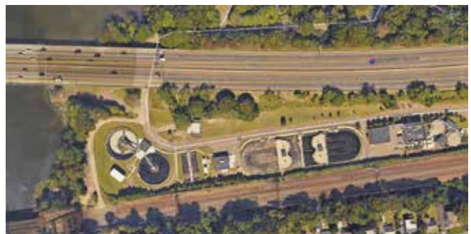
Figure 4: Work area east of Saugatuck River, Westport CT