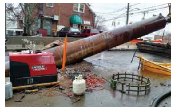
Figure 8: Installation of the conductor sleeve