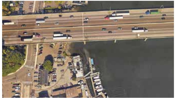
Figure 2: Work area west of Saugatuck River, Westport CT