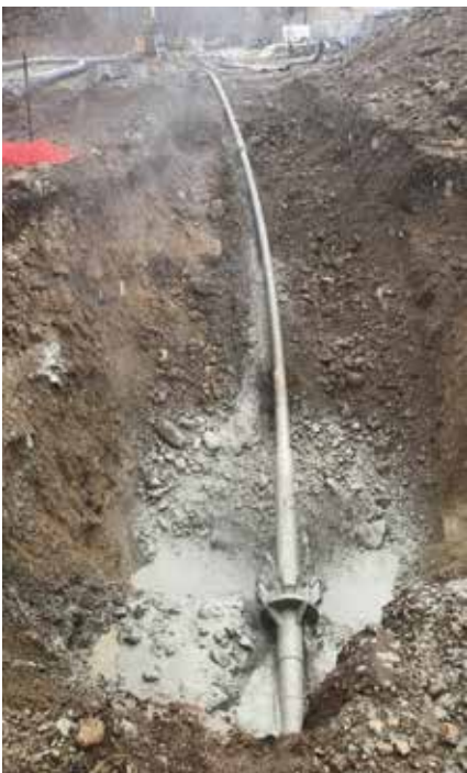
Figure 11: 22-inch diameter reamer exiting on the east side

The final HDD alignment was designed with HDD entry/exit angles of 18 degrees and 12 degrees on west and east sides with a total length of 1,300 feet and approximately 90 feet in depth from the HDD entry location. The pipe laydown for pullback was designed east of the river along the treatment plant access road. A combination of a steep entry angle and use of a steel conductor sleeve was recommended to be used on the HDD entry (west) side to mitigate the potential for inadvertent returns while drilling from the ground surface to the top of bedrock. This was also intended to mitigate the potential for over-excavation and settlement of the nearby utilities and