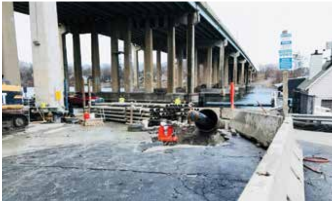
Figure 15: View of the I-95 Bridge and the product pipe